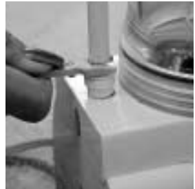
Figure 14 Disconnecting outlet tube